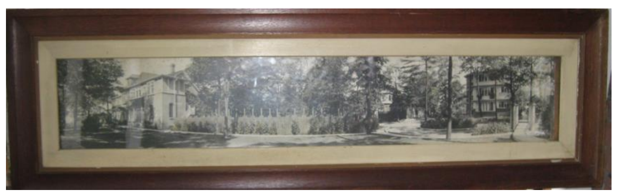
Panoramic photograph of the southward extension of Benlamond Avenue