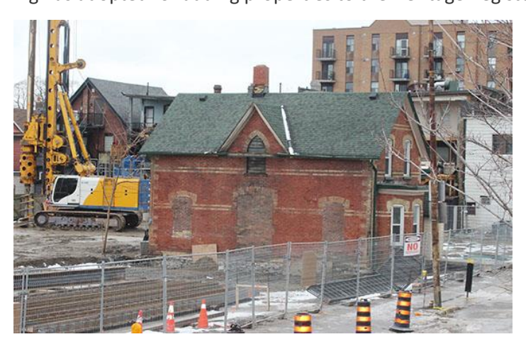
Preparing to move 292 Main Street, December 2020 Alan Shackleton/Beach Metro Community News, December 29, 2020