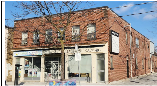
143 Main Street. Built 1927. Representative of an early-20 th century Main Street Commercial Row type building with commercial uses at grade. Housed community's post office 1930-1950.

Council added them to the Toronto Heritage Register on March 20, 2024. See https://secure.toronto.ca/council/agenda-item.do?item=2024.TE11.14