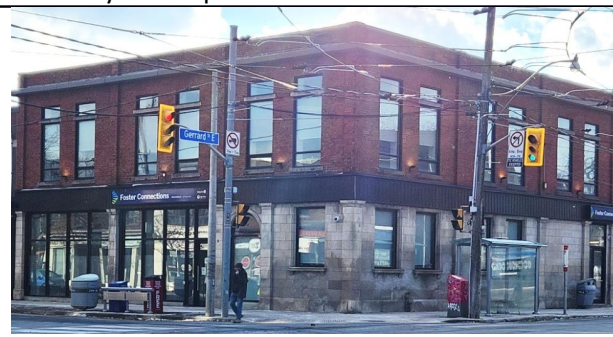
164 Main Street, southwest corner of Gerrard Street East. Built 1903. Representative of an early-20 th Main Street Commercial Block type building. Historically known as Snell's Hall, valued for its association with the Snell family, significant in the early development of East Toronto.

Ten properties in four buildings at Main and Gerrard were added to the Toronto Heritage Register, 20 March 2024