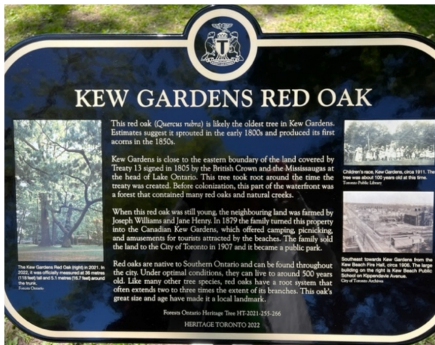
Kew Gardens Red Oak Plaque Presented by Heritage Toronto, May 25, 2023

Working to highlight and preserve the natural, built and documentary heritage of The Beach and East Toronto