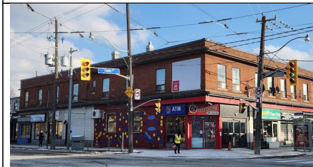
155, 161, and 167 Main Street and 2201-2207 Gerrard Street East. Built 1903. Representative of early-20 th century Main Street Commercial Block building. Valued for its association with the Snell family, significant in the early development of East Toronto.