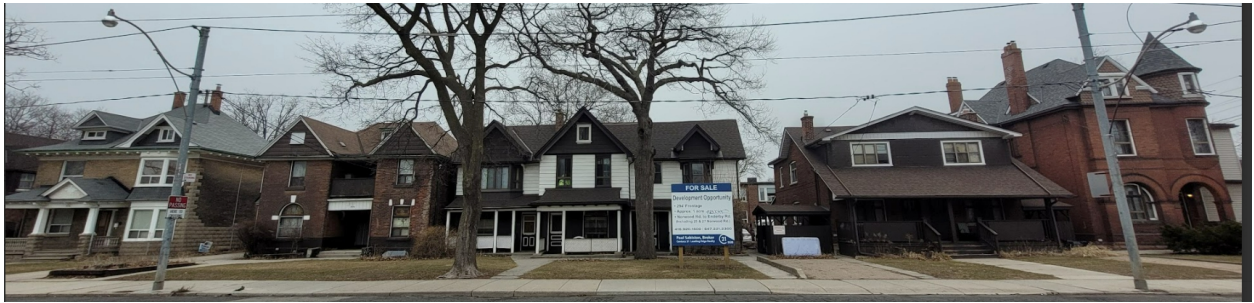
Panoramic view of 2174, 2178, 2180, 2182, 2184, 2186, 2188 and 2190 Gerrard Street East, March 2024

were currently for sale as a development related land assembly.” TBETHS offered to provide research on these properties.