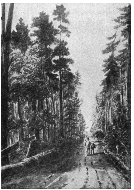
Kingston Road, from a water colour by Lt.-Col. Jas. Cockburn (about 1830)

To put the area in the context of the 1830s, immigration was increasing rapidly from the British Isles; and farms, sawmills and roads in the greater Toronto area were growing by leaps and bounds. Although water transportation was still a critical means of transit, Kingston Road was being planked and by 1839 there were daily stage coaches all the way to Kingston, Ontario. Railways were being constructed in Quebec and in the Niagara area. Talk of a railway in York County was in the air.