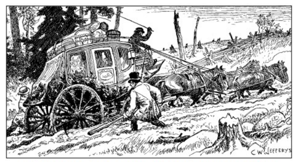
Early roads posed many problems, as the teams pulling wagons often got bogged down in muc

remained muddy, rough, and corrugated until gravel was quarried later in the century.