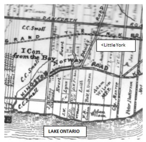
Adaptation of Tremaine's map (1861) illustrating the Grand Trunk Railway and Little York.

At this point in our story the Grand Trunk Railway makes its entrance in 1856 just south of Danforth, with a flag stop named "York" (later to be called Little York). Rail traffic soon replaces much of the lake cargo transit and for Clem a trip to Whitby would have been much quicker.