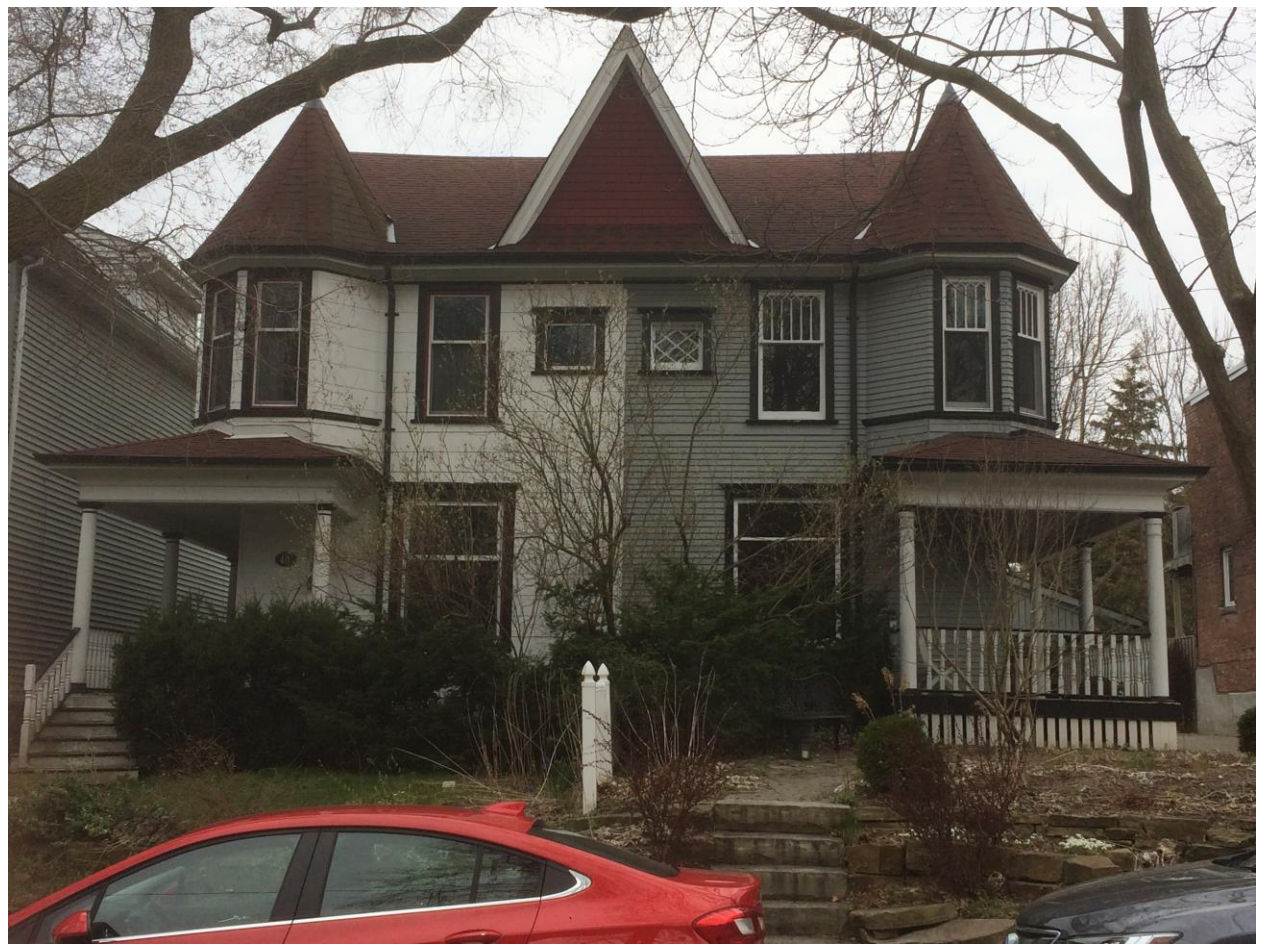
40 and 42 Elmer Avenue, April 29, 2020

In April 2018, the owners of 40 and 42 Elmer Avenue submitted joint applications for 'consent' to sever and create three residential lots from the original two lots; in addition, applications were submitted to permit one detached and two semi-detached three-storey residential homes.