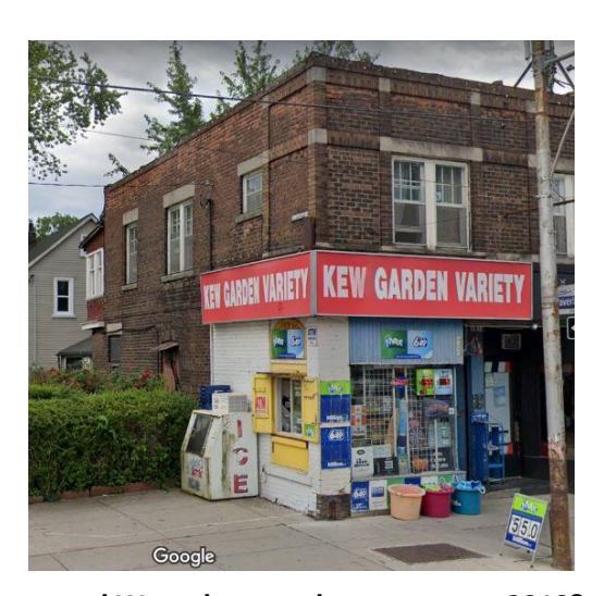
Queen and Waverley, southwest corner, 2019?

His old business is now a convenience store.